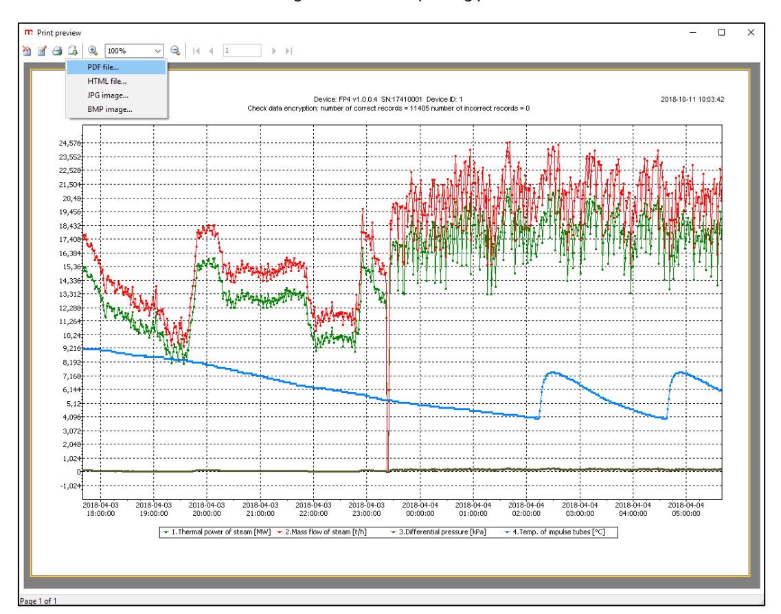
Fig. 5.4 Chart printing preview.